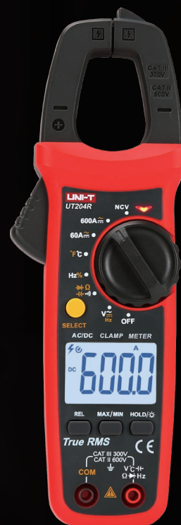
UT203R/204R (AC/DC current)