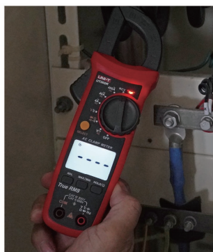
NCV multi-segment display and audio/visual alarm