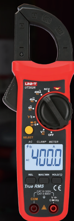
UT201R/202R/202F (AC current only)