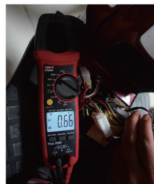
In current and voltage range measurement. Accuracy guarantee range 1%~100%