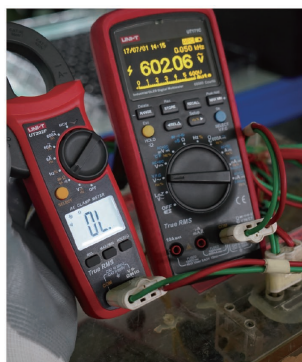
600V protection across all range